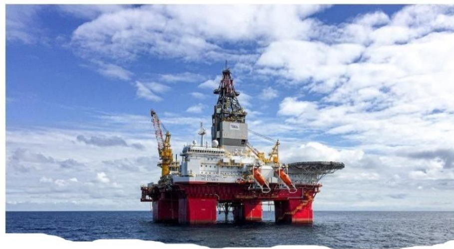
Oil and Gas