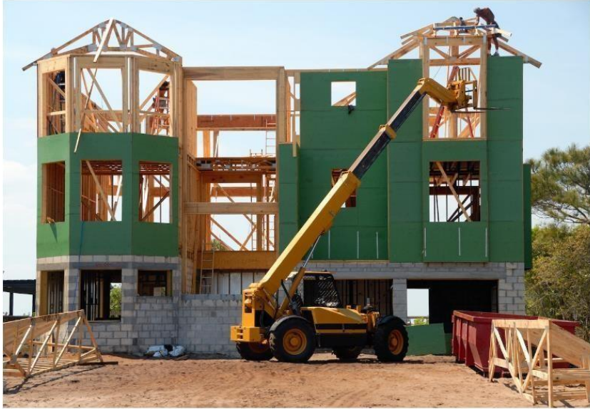
Real Estate Investments